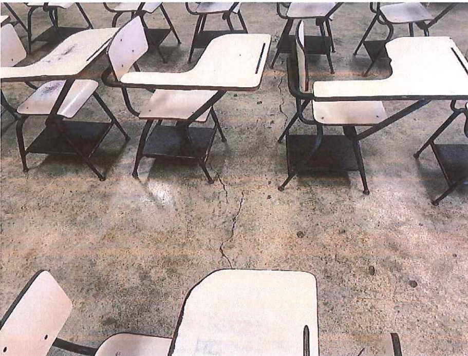
Foto 2: Grietas en terminación de piso y filtraciones en la mayoría de los edificios del plantel.