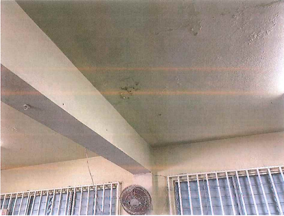
Foto 3: Grietas en terminación de piso y filtraciones en la mayoría de los edificios del plantel.