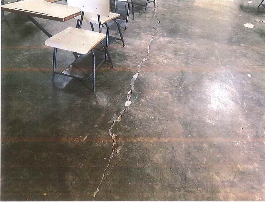
Foto 1: Grietas en terminación de piso y filtraciones en la mayoría de los edificios del plantel.